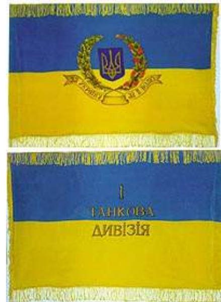
The battle flag of the military unit (overboard and reverse), proposed by the Center for the development of the form of clothing of the Armed

To process the projects of the military flags of the military units in 1992, in the newly formed Ministry of Defense of Ukraine, according to the decision of the Minister-General, Colonel-General Kostiantyn Morozov, a special commission was organized, which dealt with the development of a new military uniform and military symbols, in particular the flags.