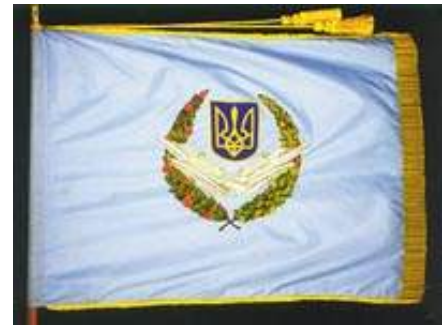
Flag of the Anti-Traffic Defense Forces.