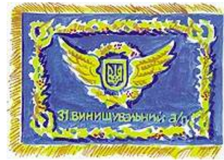
Combat flag of the units of the Reservoir Space Defense Forces (SOP) (reverse). Authors of O. Rudenko i K.Glomozoda

In October 1993, the Collegium of the Ministry of Defense of Ukraine approved the projects of the Battle Flag of the Military Unit and the flags of the Armed Forces – the Sustopunx of the Troops, the Military-Maritime Forces and the Military Defense Army, proposed by the Ms.Ministry Office. It should be noted that the flag of the Viysk of the Anti-Hunting Defense is already in history (after the abolition in 1997 of this type of Armory of the Forces and the introduction of the military-potryany x-shevix of forces and the Anti-Trieting Forces).