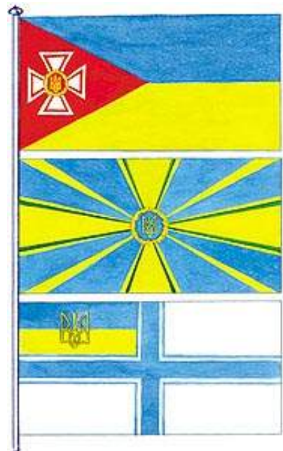
Flags of the Army, Aviation and the fleet.

Of course, it would be strange if after the tragic and dramatic history of the struggle for the freedom of Ukraine in Ukraine itself, at least half or a third of the flags that were flying over the Cossack regiments or the Ukrainian people of the UPR were preserved. Self-understood: there are no flags – there is no army, there is no army – there is no state. To this all non-Ukrainian rulers of the Ukrainian land tried to ointment, or even destroy the post-reliable flags of the Ukrainian army and even the attention, the memory of the nix. It turned out that the Ukrainian military flags are now presented in the museum x of the West (flags of Bogdan Xmelnitsky and Ivan Moses), Poland, Russia, Kanada and inch countries, and in the museum store of Ukraine it is the smallest, only four. They are stored in