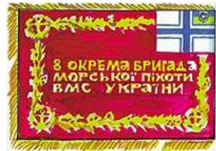
Battle Flag landmark parts VMS of Ukraine (reverse)

The Center for the development of the shape of clothing of the Tile of the Armed Forces of Ukraine offered the Battle Flag of the military unit in the form of the State Flag with the placement on the front side of its symbol of the Armory of Forces – a blue shield with a yellow strip of yellow on it. This symbol is bordered on one side by an oak one, and on the other – a viburnum branch. Under the symbol was a ribbon with the inscription "For Ukraine, for its will." The words, to the proposal of Major A.Kulich, were taken from the famous song of the Ukrainian sichovyx of the shooting range. On the reverse side of the flag it was planned to sew an inscription with the name of the military part (5).