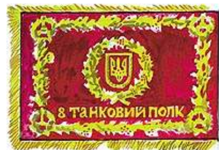
Combat flag of the Navy units of the Navy (reverse)

With the revival of work on the military flags began to provide proposals from military units, public organizations and individuals, interested in this matter. It was collected by the Center for the development of the form of clothing of the Tile of the Armed Forces of Ukraine. After in December 1995 The center was disbanded, some materials with proposals and projects were sent to the funds of the Central Museum of the Armed Forces of Ukraine