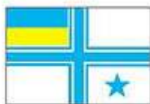
Flag Unit Commander