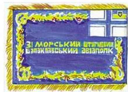
Combat flag of aviatsine part VMS of Ukraine (reverse)

Flags of the types of weapons of the Armed Forces in the project of O. Rudenko and K. Glomozods were close to their proposed combat flags, but only with the symbol of the Armory of the Forces, without the inscription. The project of the six authors was finally taken as the basis of the Commission of the Ministry of Defense of Ukraine.