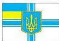
Flag of Miiser Defense of Ukraine