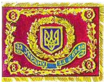
Combat flag of ground defense forces units, as well as ground parts VMS of Ukraine (over)