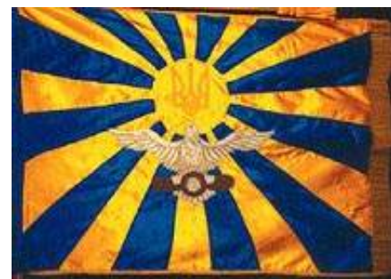
Flag Military-pots of forces. Developed from the initiative of V.Auntots