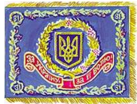
Combat flag of the units of the Anti-Spain Forces (SOP), as well as aviation units VMS of Ukraine (over)

For the purpose of organized and planned preparation for the manufacture of combat flags, changing the names of associations and connections, it was assumed to carry out a number of events. The commanders of the Usix were obliged to submit to the Main Headquarters of the Armed Forces of Ukraine by September 10, 1993 a clarified list of military units for which it is planned to produce flags. As it was determined, it was necessary to produce for the usix military units, starting with the battalion, with the exception of parts of the thermal and rear support, oskoron and maintenance, military construction workers. First of all, the flags were intended for divisions, brigades and regiments.