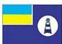
Flag hydrographics of vessels

Armed Forces of Ukraine in the agenda of the session was discussed, the first Deputy Minister of Defense of Ukraine, Colonel-General Ivan Bezhan, was discussed. However, the members of the Presidium made it possible to return the submitted document for revision to the Commission of the Verkhovna Rada on Defense and State Security, which was supposed to initiate the consideration of this issue later – after the approval of the State Emblem of Ukraine.