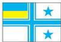
Commander's Flag maritime area (squadrons)

The flag of the chief Staff Military-seas the Ukrainian Forces