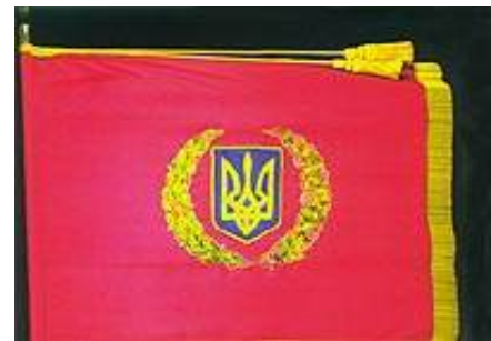
Flag of Sussottnyx troops

In October 1993, the Collegium of the Ministry of Defense of Ukraine approved the projects of the Battle Flag of the Military Unit and the flags of the Armed Forces – the Sustopunx of the Troops, the Military-Maritime Forces and the Military Defense Army, proposed by the Ms.Ministry Office. It should be noted that the flag of the Viysk of the Anti-Hunting Defense is already in history (after the abolition in 1997 of this type of Armory of the Forces and the introduction of the military-potryany x-shevix of forces and the Anti-Trieting Forces).