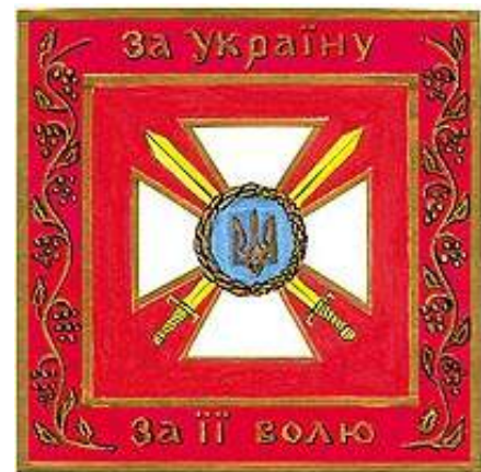
Battle Flag military part. Avtor O.Koxan. Variant refinement CM AFU

Nevertheless, after the approval of a single sample of flags, the widespread introduction of it did not take place. Instead, new offers began to appear. In particular, in the publication of the Ukrainian Heraldic Society "Znak" his development was published by Oleksii Koxan (8). The author offered the flag of the Armed Forces of Ukraine in the form of a square raspberry cloth with a free white Cossack cross in the center and the gold Trizub imposed on it in a round blue field, bordered with a golden laurel vinok. The flag of the Air Force was built according to the same model and differed only in color – the cloth is blue, and the xrest is yellow. The naval flag was sent to the military-borne commission of the Ministry of Defense of the Warrito.