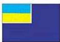
Flag aids of vessels