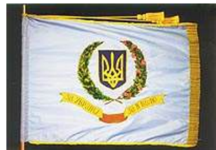
Flag Military Defense Forces

The Regulations on the Battle Flag of the Armed Forces of Ukraine determined that the Battle Flag is a symbol of honor, valor and glory. He calls on every soldier to serve the people of Ukraine, courageously, skillfully and intactly defend the Ukrainian state, without sparing his blood and life itself. The Combat Flag is served after the formation of a part by the officials of the Ministry of Defense of Ukraine on behalf of the President of Ukraine as the Navy